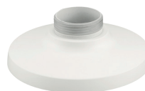
SBP-187HMW (White) / SBP-187HM